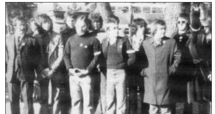
Above: Denied access to the civic ceremony, in November 1973, Gay News reported on the Sussex Gay Liberation Front's own remembrance service held afterwards. Contrast this to today where the Lesbian and Gay men of the wars are publically commemorated.