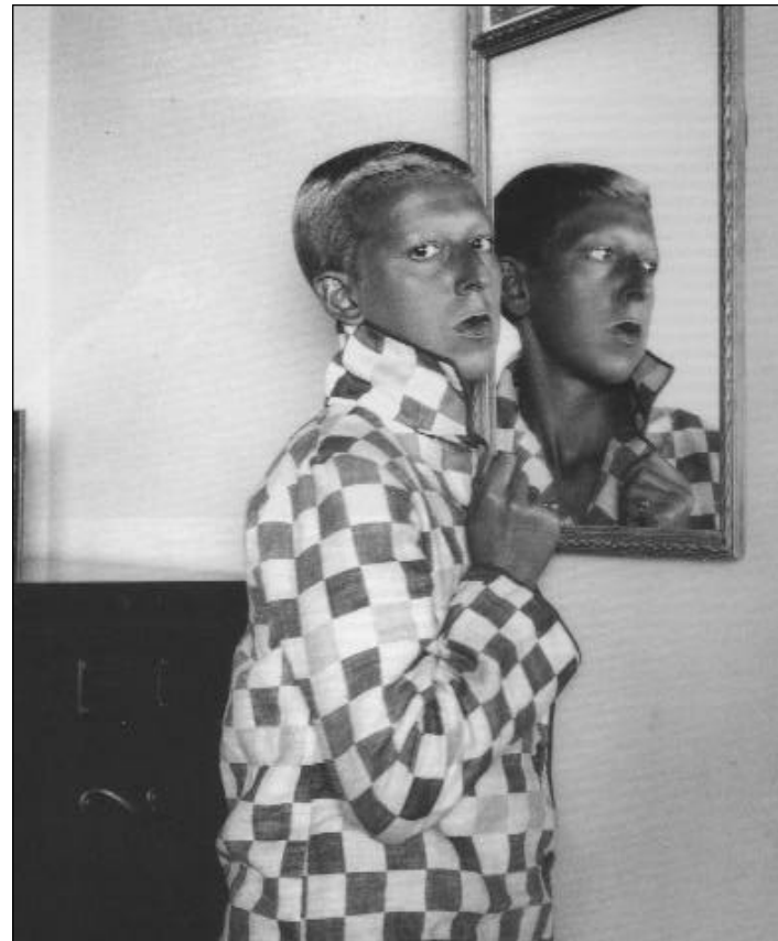
Claude Cahun, self portrait c 1928